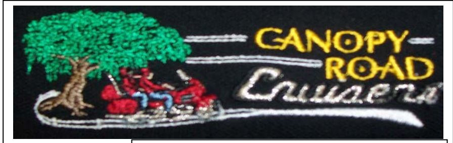
Chapter FL1-A2 Tallahassee, Florida