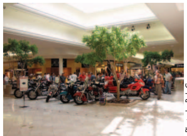
Bikes all ready before the crowds arrived!