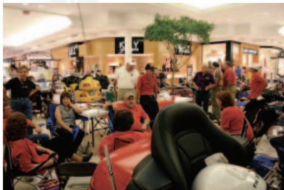
Twenty-one bikes on display and super member participation.