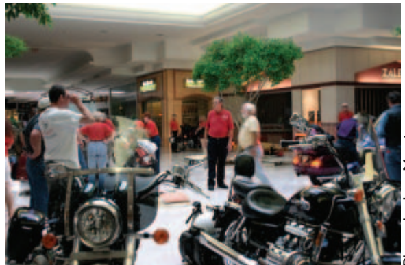
8 am - Bring'em in and sett'em up