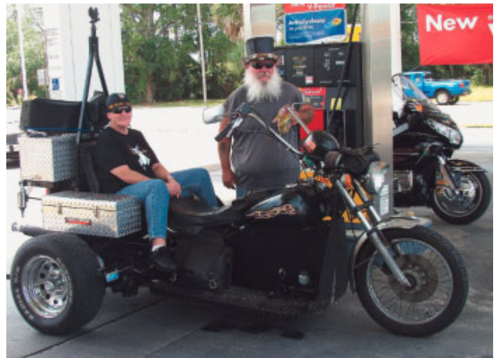
"Bearded Guy" and co-rider at the Beacon Hill Gas Stop made the trip even more memorable.