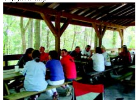
Plenty of benches & tables. Good thing because we had a great turnout.