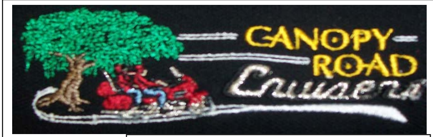
Chapter FL1-A2 Tallahassee, Florida