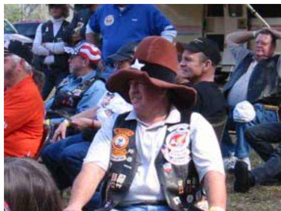
Far Left: Wow, what a fabulous turnout we had this year!