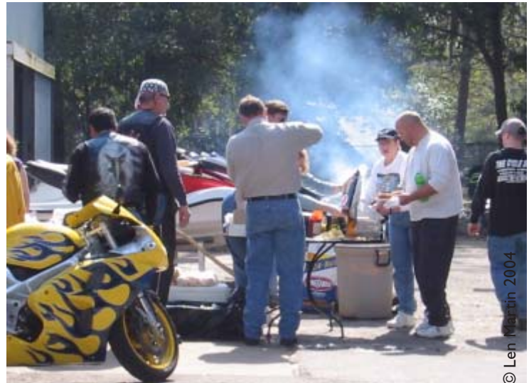
Thanks to The Cycle Shop for providing some delicious lunch time vittles for our hungry Poker Run riders.