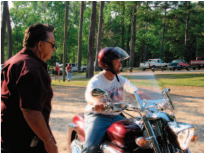
Below: Waiting for the Chicken, waiting for the chicken, waiting.....but it was worth it! Everything was delicious!