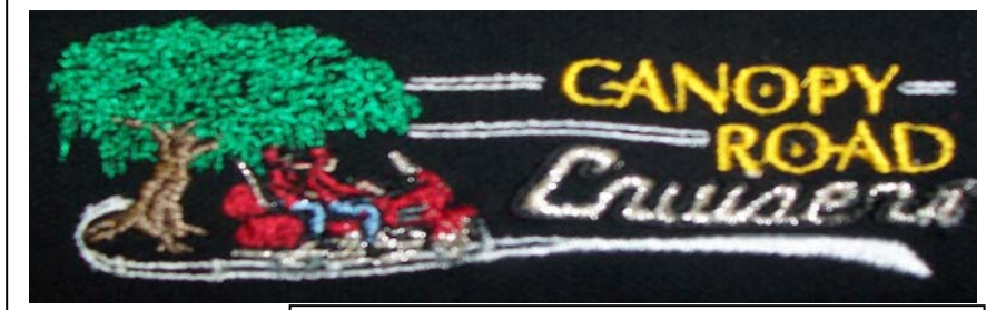
Chapter FL1-A2 Tallahassee, Florida