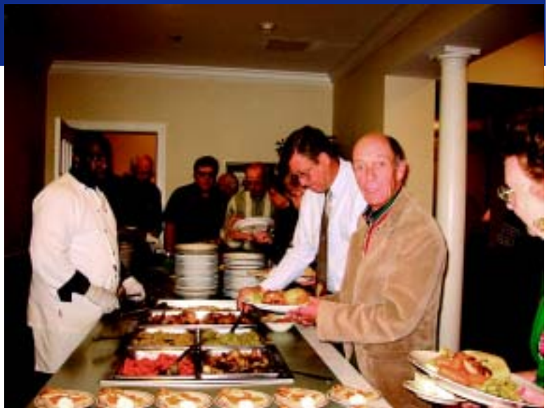
Above: A delicious buffet was prepared by the Edenbrook staff.

Last Year we had no photographs of our Christmas Party. This year we have enough for several issues. What a great turn-out we had.