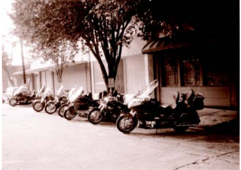
Enjoying an outing to Monticello.