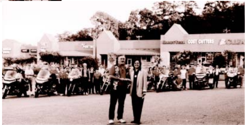
Good people doing good things for our community.