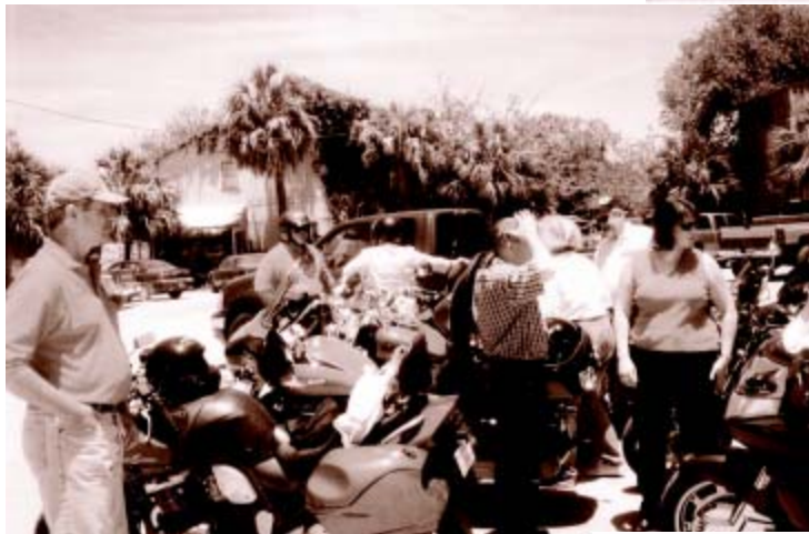
Fun in the Sun at Apalachicola