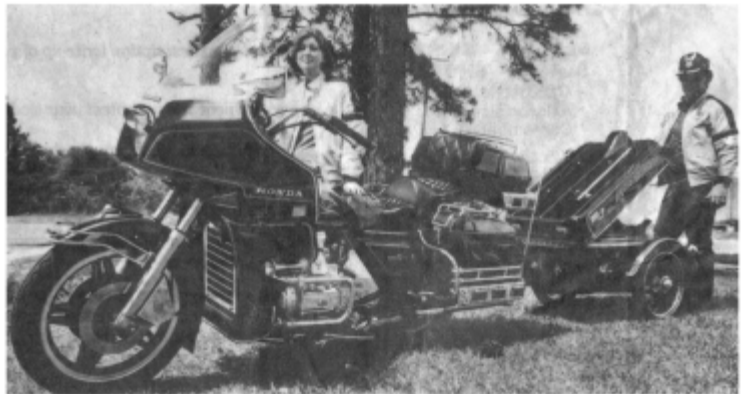
A classy outfit for traveling

...of the group motorcycle for better fun and travel.