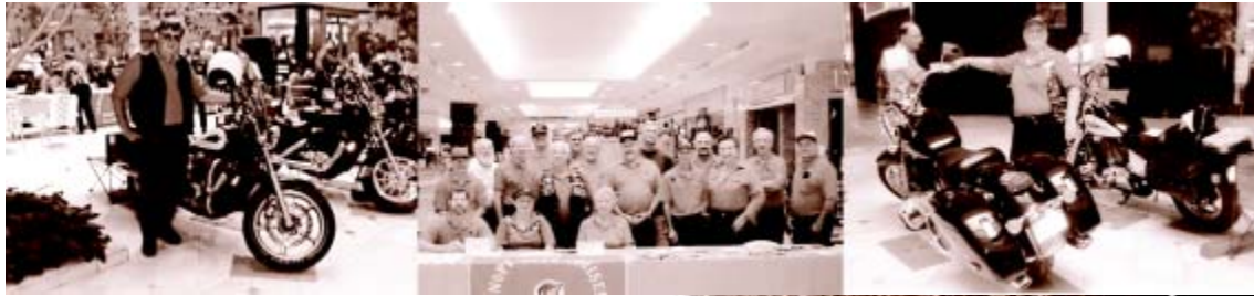
Tallahassee Bike Show 2001