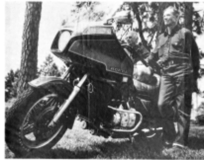
Air compressors to adjust the shocks

...provide the smoothest ride possible on the new model. Adjustment, for options, Class and Quality