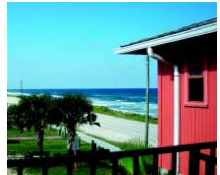
The view from our motel balcony.

We stayed in Flagler Beach an extra two days to enjoy the beach. While it was good to be amongst our "own kind", we also enjoyed the peace and quiet when the bikers left. What a great anniversary!