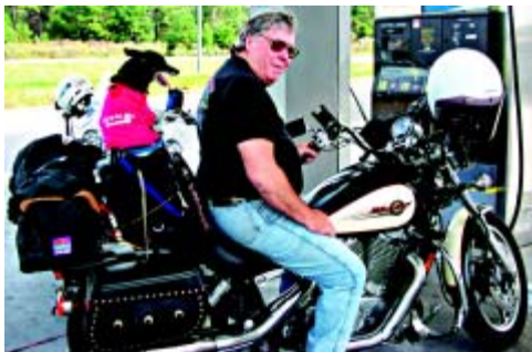
Woodstock poses for photos at a gas stop in Live Oak. Her sweater says, "bad to the bone"!