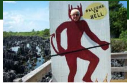
Actually this was taken in Hell, Grand Cayman Island. It was so named for the bizarre lava rock formations.