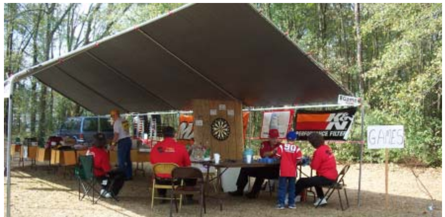
Above: Our Rally Crew does a great job of setting up all the tents, games, and door prizes.

Julia Mae's -Carrabelle, FL K & N Air Filters -Riverside, CA Maquires - Location Unknown Milestone Press -Almond, NC Northside Mowers Tallahassee, FL Parker Specialty Advertising Tallahassee, FL Publix -Community Affairs Dept Winter Haven, FL Rider Magazine -Mt. Morris, IL Super Lube -Tallahassee, FL