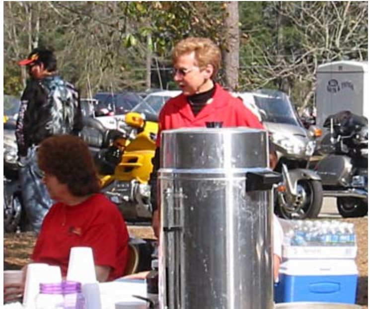
Above: It takes a big pot of coffee to keep everyone going on Rally day!